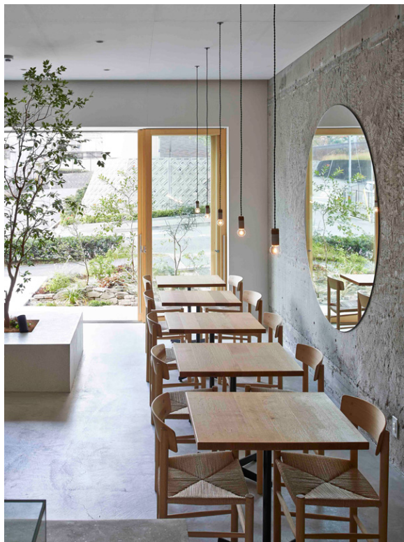
Ito-Biyori, Osaka, Japan: J39 Chair – Model 3239 – Oak / natural paper cord