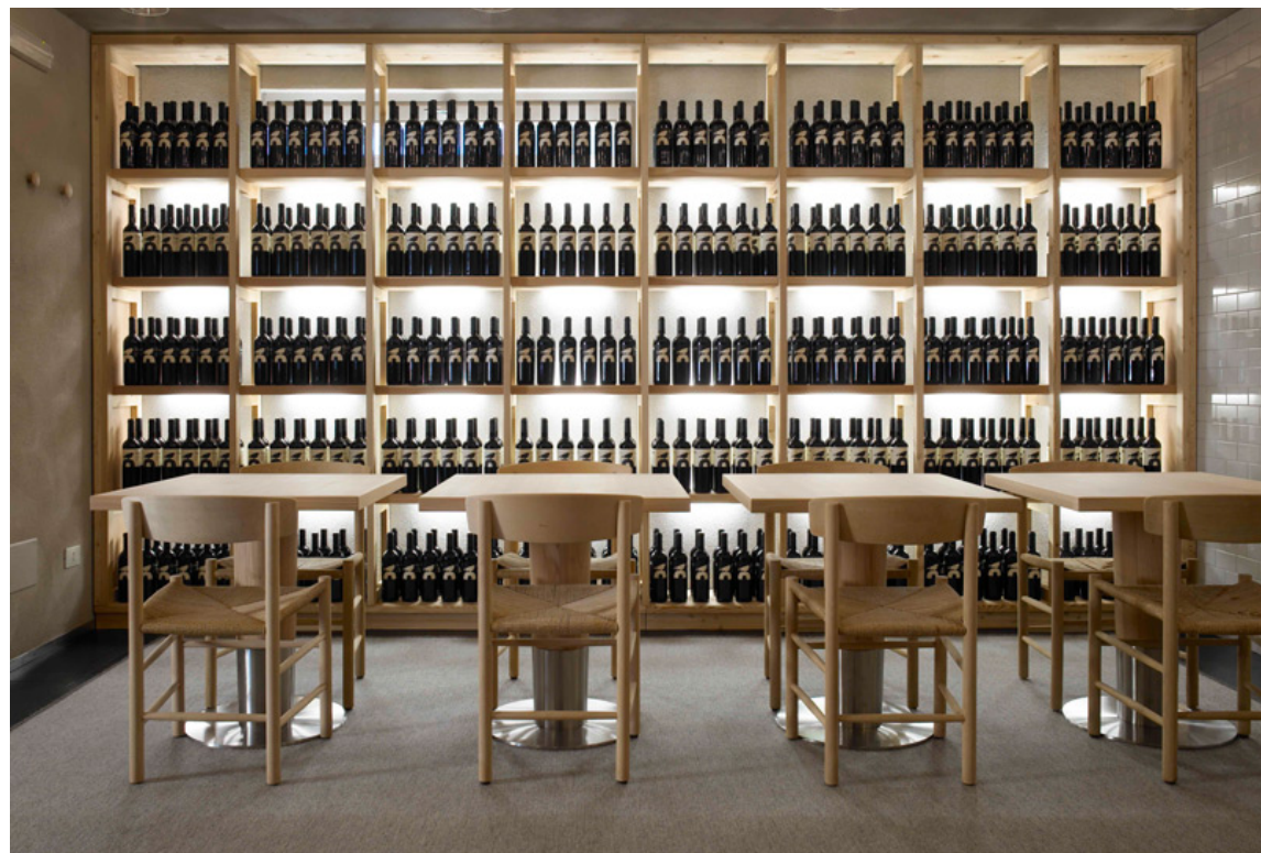
Björk Brasserie, Aosta, Italy J39 Chair – Model 3239 – Soaped oak / natural paper cord