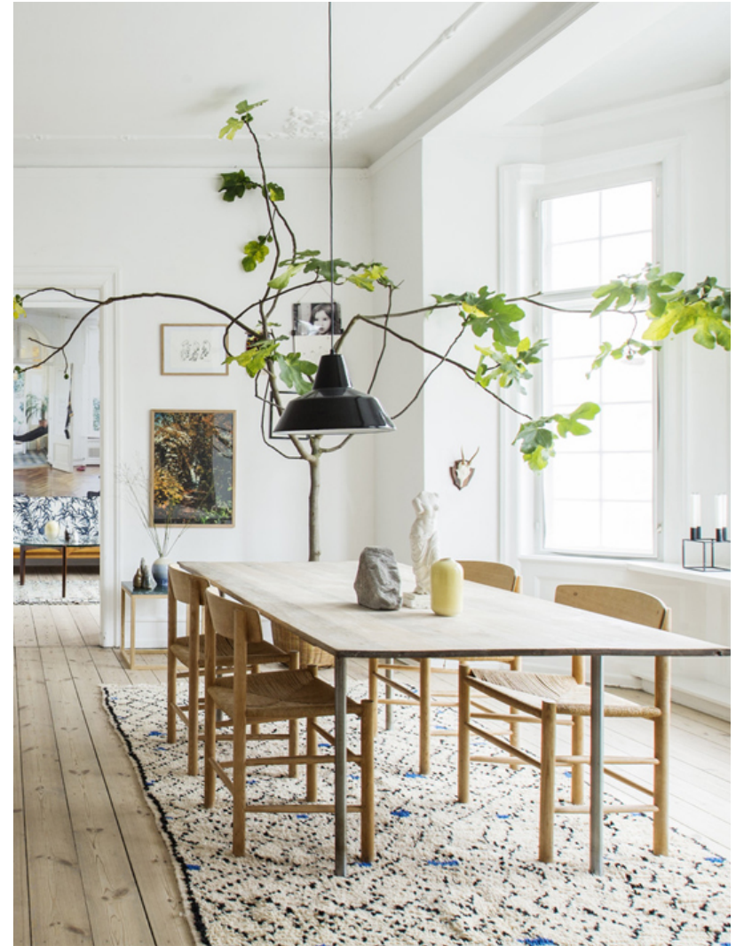
J39 – Model 3239 – Oak / natural paper cord.