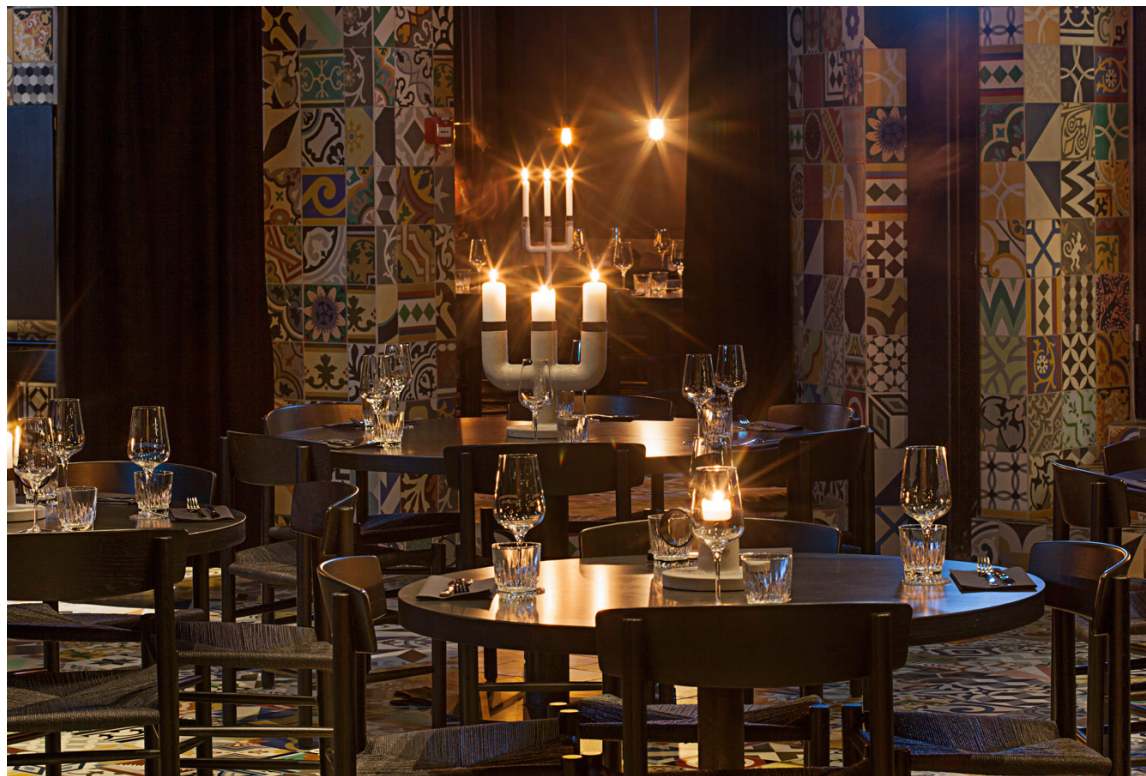
Llama, Copenhagen, Denmark J39 Chair – Model 3239 – Black lacquered oak / black paper cord.