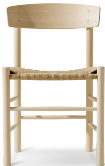
This Side: J39 – Model 3239 – Soaped oak / natural paper cord Opposite Side: J39 – Model 3239 – Soaped oak / natural paper cord