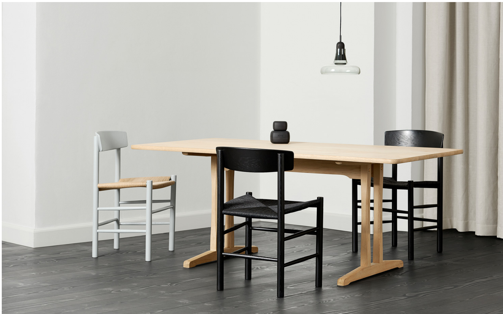
J39 Chair – Model 3239 – Painted oak (White) / natural paper cord. J39 Chair – Model 3239 – Painted oak (Black) / black paper cord. C18 – Model 6290 – Oak oil treated.