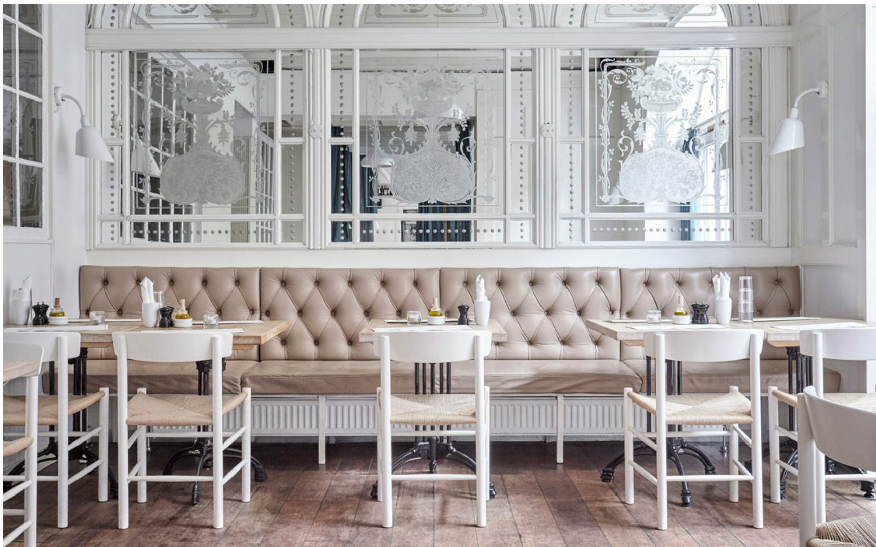
The Italian, Copenhagen, Denmark J39 Chair – Model 3239 – Painted oak (White) / natural paper cord