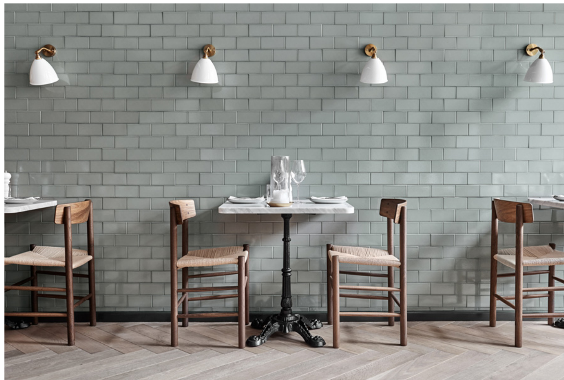
Steak Royal, Copenhagen, Denmark J39 Chair – Model 3239 – Smoked oak / natural paper cord