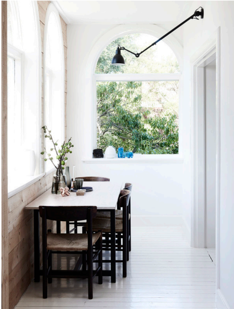
J39 – Model 3239 – Black lacquered oak / natural paper cord.