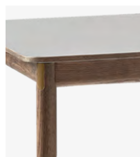
Smoked oiled oak