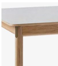
White oiled oak