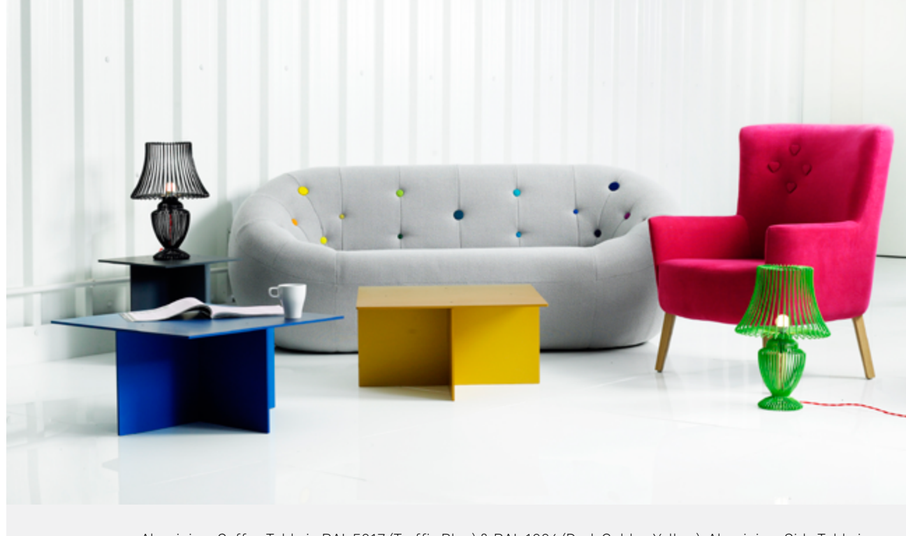
Aluminium Coffee Table in RAL 5017 (Traffic Blue) & RAL 1004 (Dark Golden Yellow); Aluminium Side Table in RAL 5011 (Steel Blue).