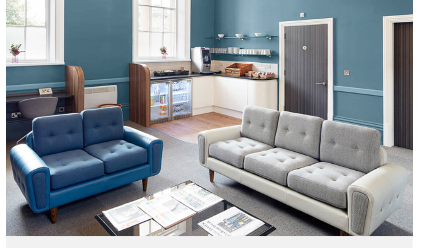
Harvey 2 Seat Sofa in Ultraleather (Ocean) & Bute Elgin (Oxford); Harvey 3 Seat Sofa in Ultraleather (Steam), Bute Turnberry (Herring) & Troon (Houndstooth) at Transpennine Express First Class Lounge, Huddersfield.

Free UK Kerbside delivery on orders over £1000. Anything below please add £45.