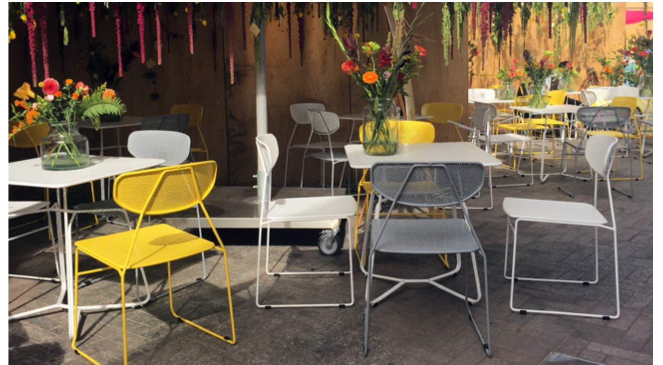
Naked Chair in RAL 1018 (Zinc Yellow), RAL 7045 (Telegrey 1) & RAL 9003 (Signal White) at Secret Garden, designjunction, King's Cross.