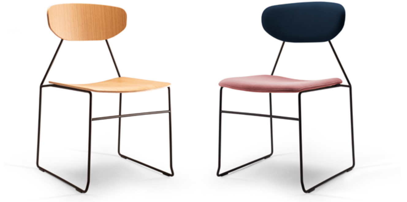
Naked Chair Indoor with frame in RAL 9005 (Jet Black) & Oak veneer, & upholstered model with seat in Febrik Uniform Mélange (Coral) & back rest in Febrik Uniform Mélange (Ink).