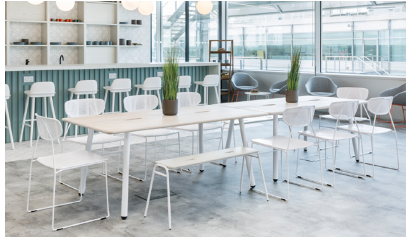
Naked Chair in RAL 9003 (Signal White).