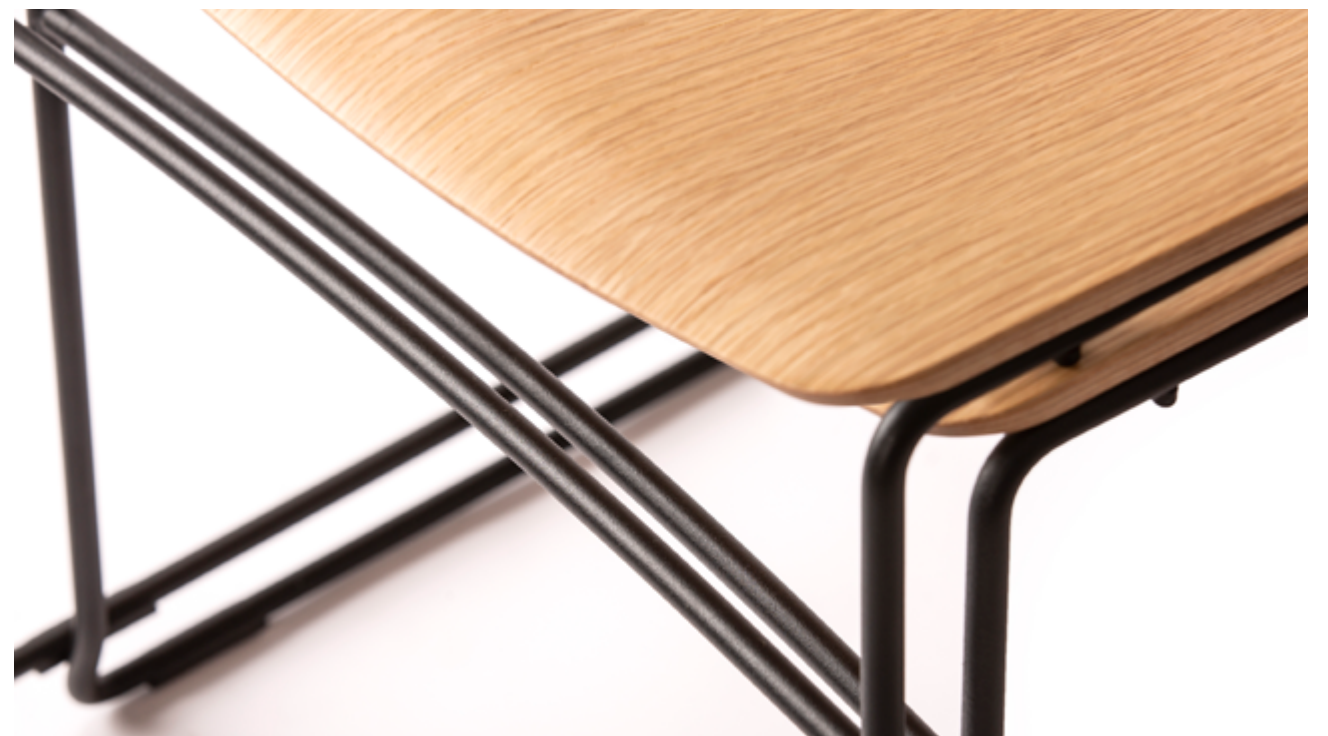
Stacking detail of Naked Chair Indoor with frame in RAL 9005 (Jet Black) & Oak veneer.