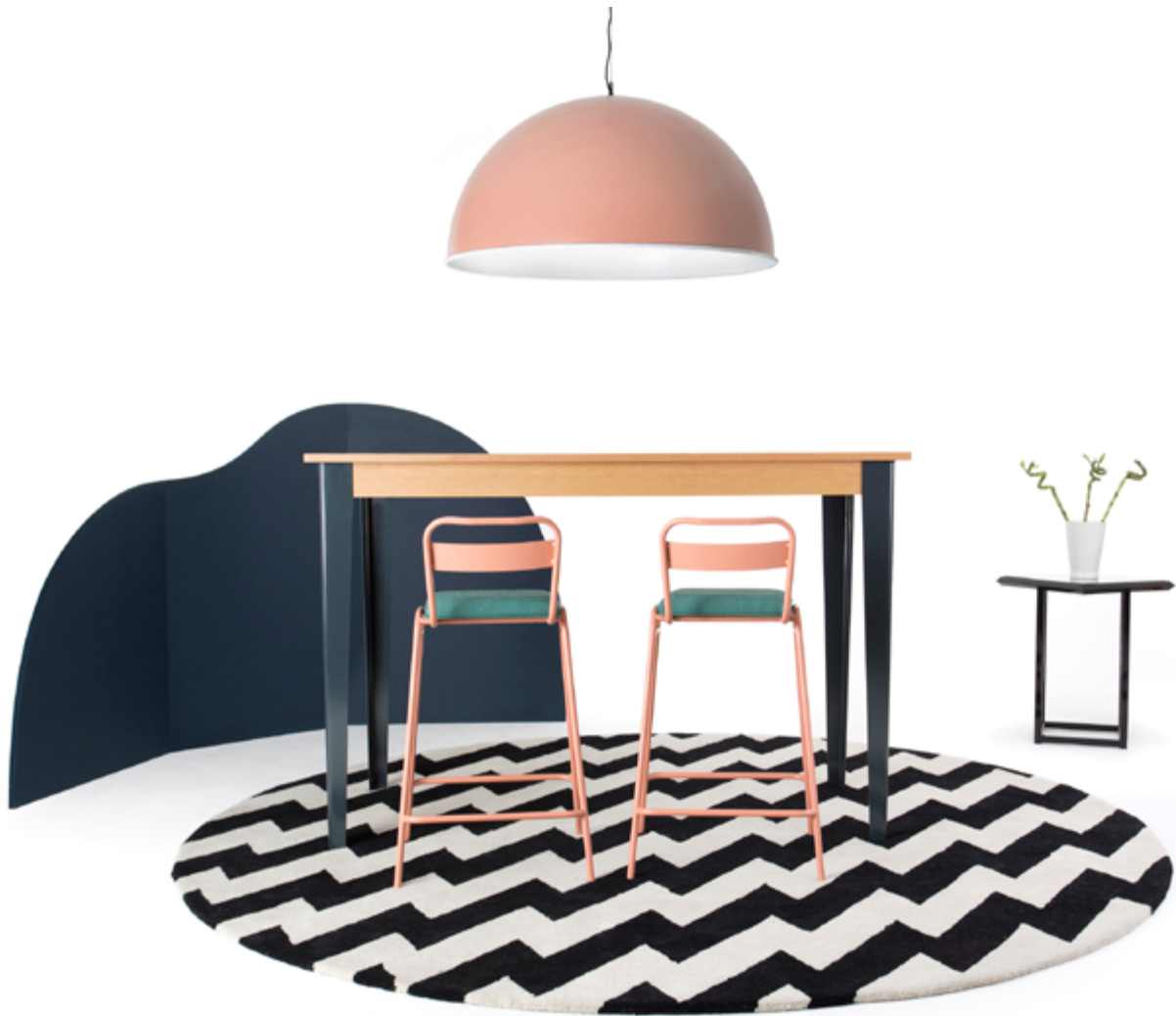
Above 2500mm (ø) Zzzap! Pop Rug. Right Detail of Wiggle, Dotty & Zzzap! Pop Rugs.

'Pop Rugs' are a new addition to Deadgood's in house collection of accessories. Drawing on a variety of influences include the Memphis Design Group and the work of New York artist Keith Haring, these bold rugs are a representation of Deadgood's eclectic and bold style and will be sure to provide a statement to a variety of interior settings. The products are hand tufted from 100% wool and available in three styles 'Zzzap', 'Dotty' and 'Wiggle', each of which can be produced in three sizes.