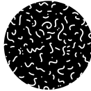
PP3 25mm (h)