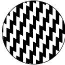
PP2 25mm (h)