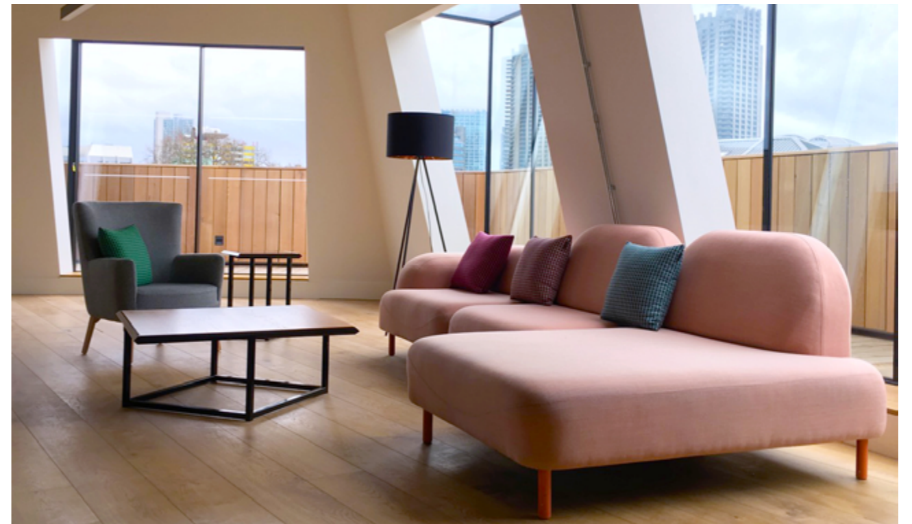
Safell Modular in Kvadrat Remix 2 (612) with legs in RAL 3012 (Beige Red) at Breather, Clerkenwell.