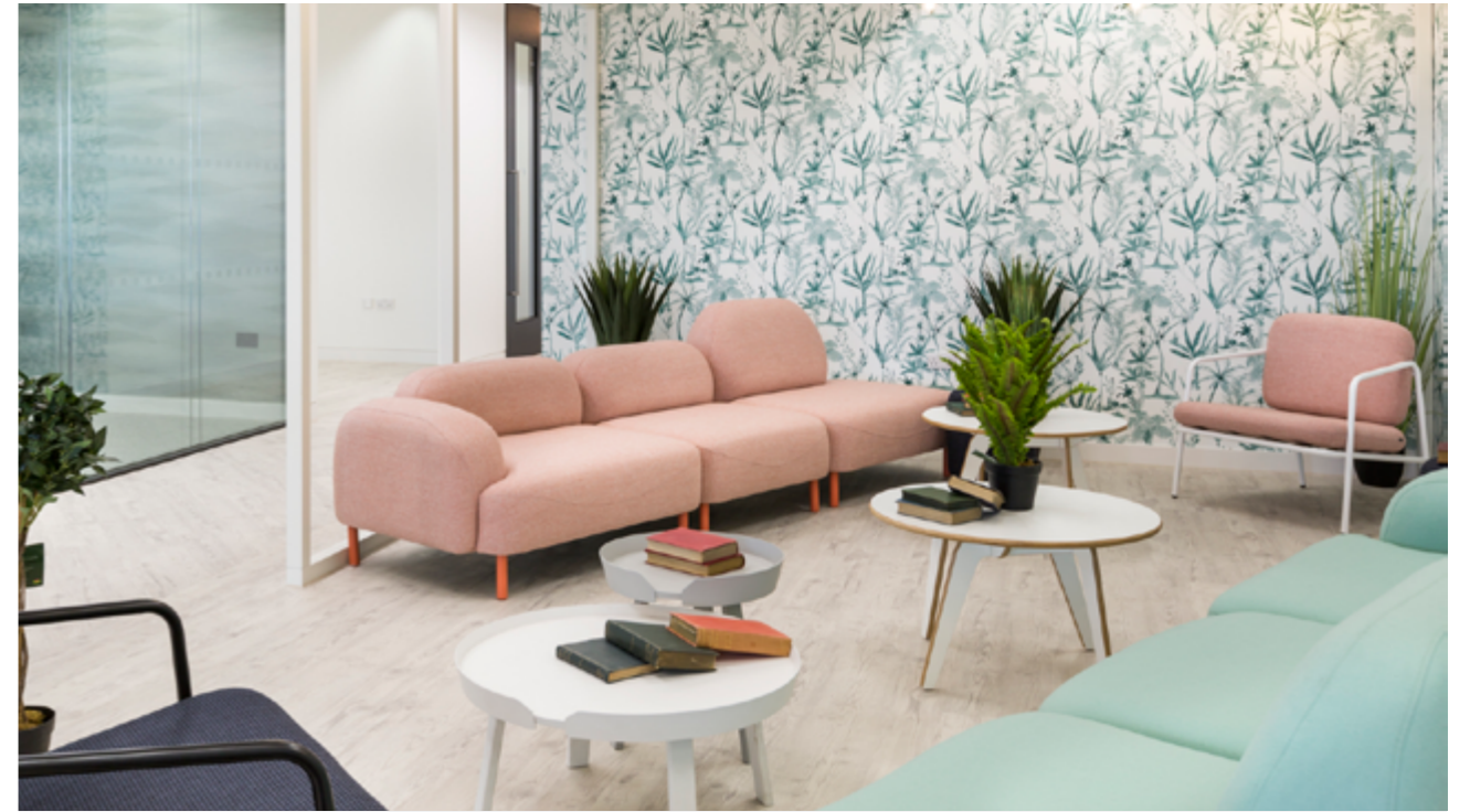
Safell Modular in Kvadrat Remix 2 (612) with legs in RAL 3012 (Beige Red); & Safell Modular in Camira Oxygen (BA055).