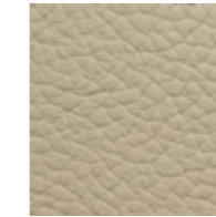
UPHOLSTERY Leather 1 & 2