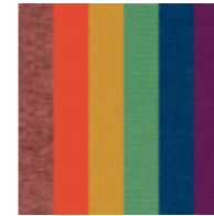
UPHOLSTERY All Fabric Bands

SS3B L / R 1,150mm (w) x 1,410mm (d) x 640mm (h) 400mm seat height