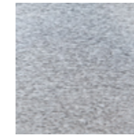
LEG Brushed Aluminium