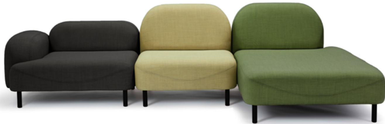
Safell Modular in Kvadrat Remix 2 (173, 933 & 982) with legs in RAL 9005 (Jet Black).