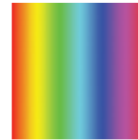
LEG Bespoke RAL