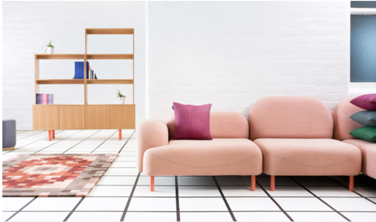
Safell Modular in Kvadrat Remix 2 (612) with legs in RAL 3012 (Beige Red).