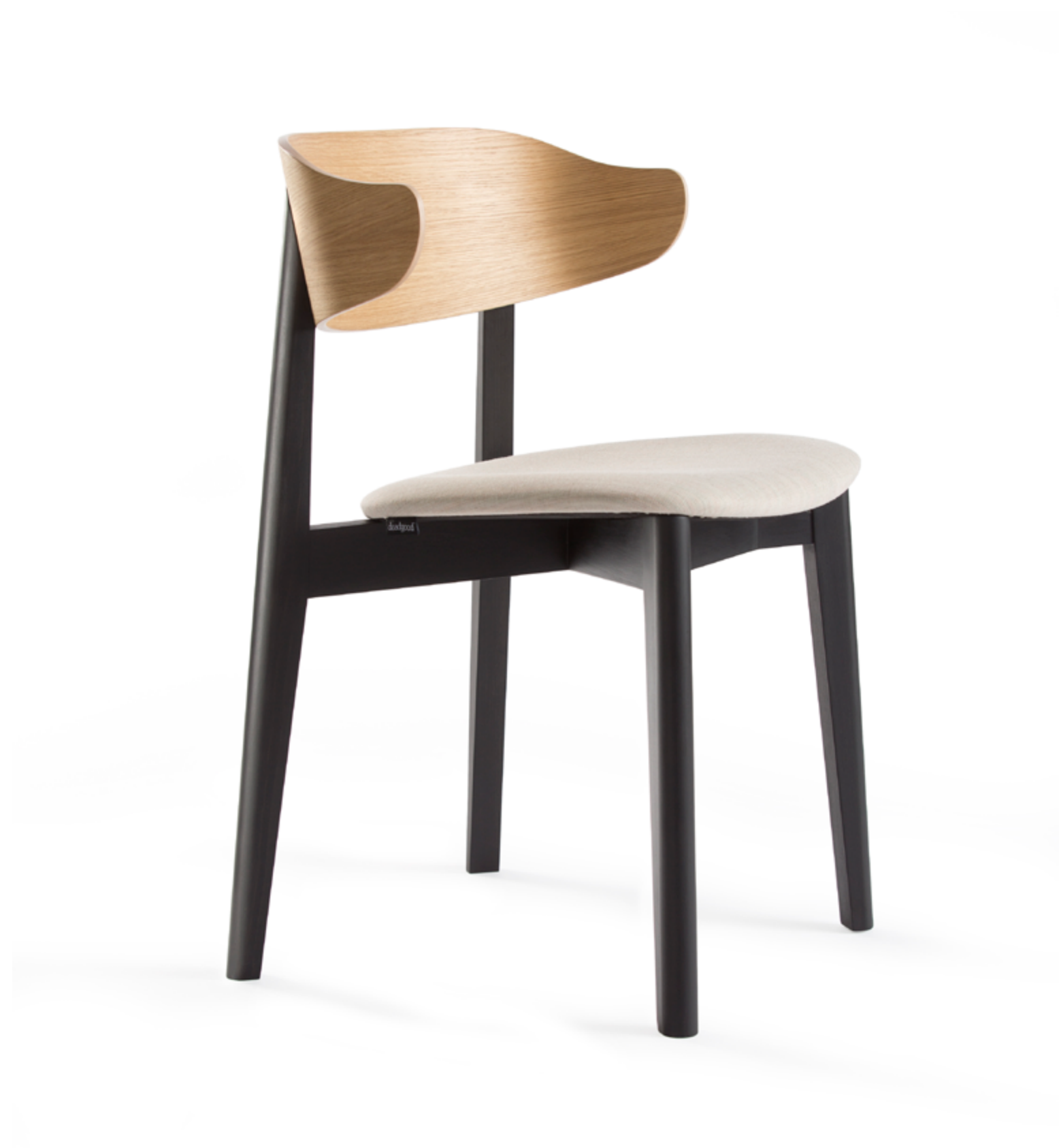
Setter Chair with oak show wood back & seat in Kvadrat Canvas 2 (216).

BACK REST Oak BACK REST RAL Lacquered Beech BACK REST All Fabric Bands BACK REST COM BACK REST Leather 1 & 2