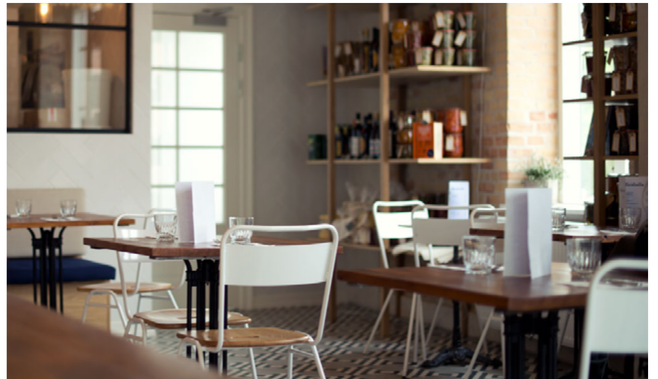
Working Girl Chair in RAL 9003 (Signal White) & oak seats at Mirabelle Bakery, Copenhagen.