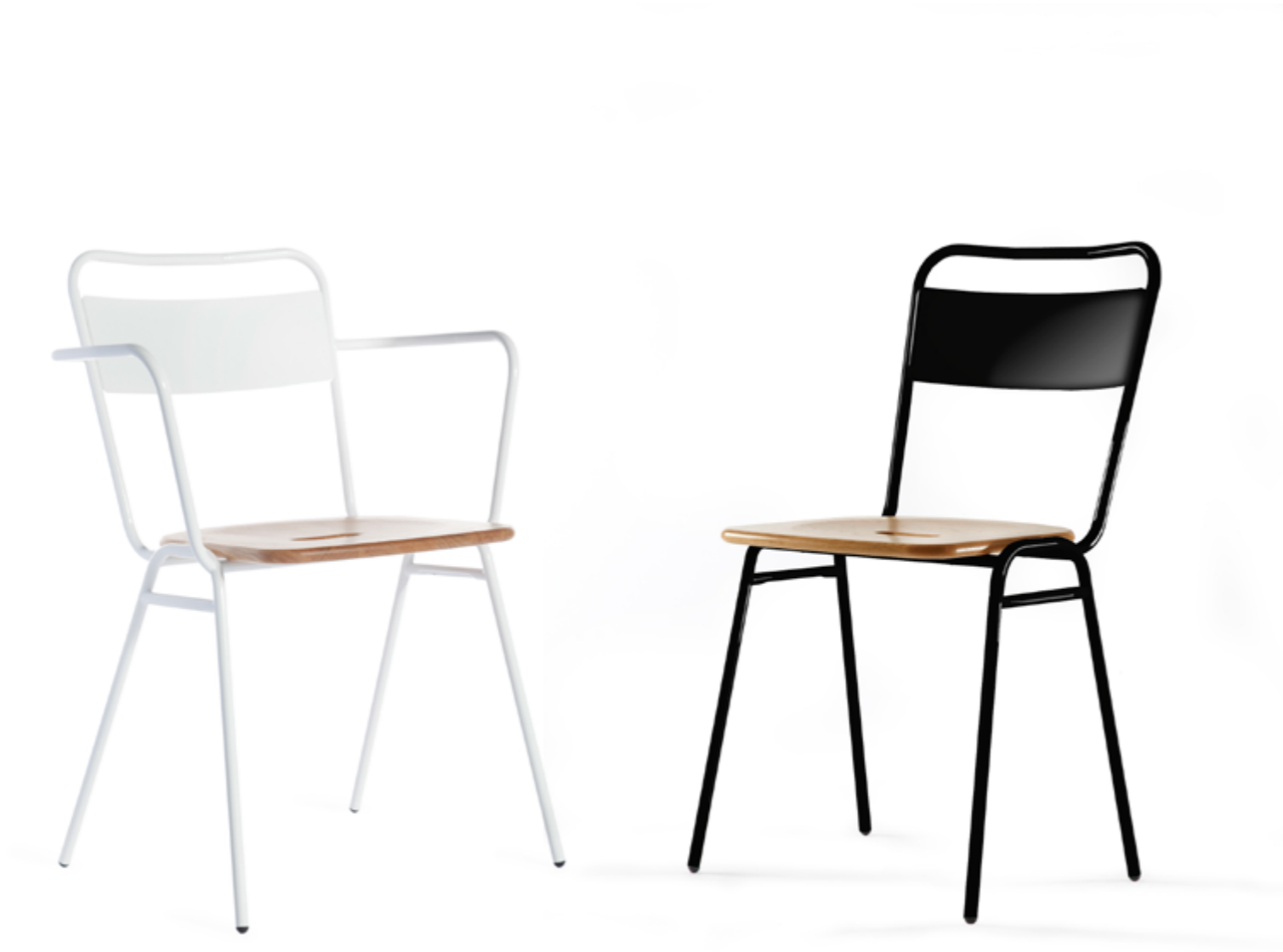
Above Working Girl Armchair in RAL 9003 (Signal White) & oak; Working Girl Chair in RAL 9005 (Jet Black) & oak. Right Detail of Working Girl Armchair stack.

The Working Girl Collection's aesthetic takes reference from simple utilitarian styling and combines robust material choices with considered detailing to create an inherently functional range of products. Each product in the table range boasts a handy aperture that enhances its portability, and encourages effective cable management should it be required.