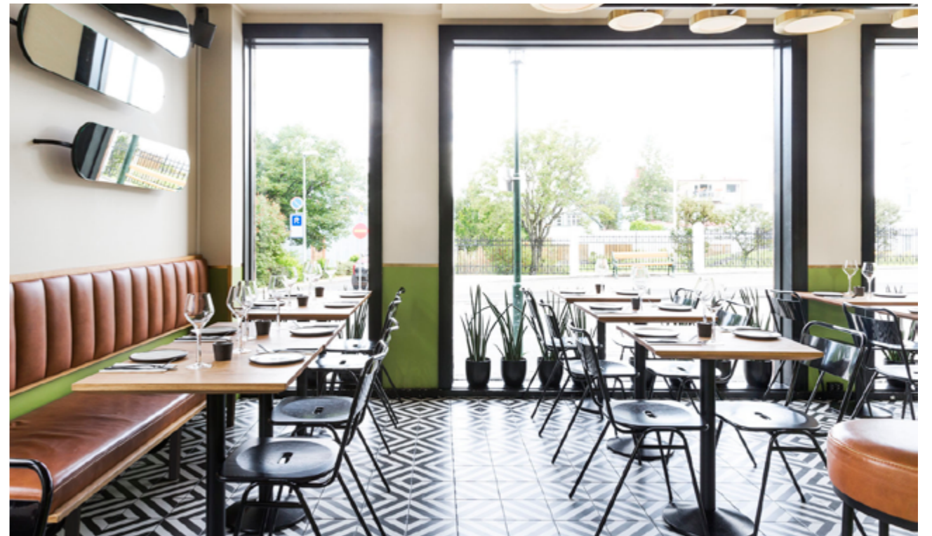
Working Girl Chair in RAL 9005 (Jet Black) & matching RAL lacquered oak seats at Mat Bar, Reykjavik.