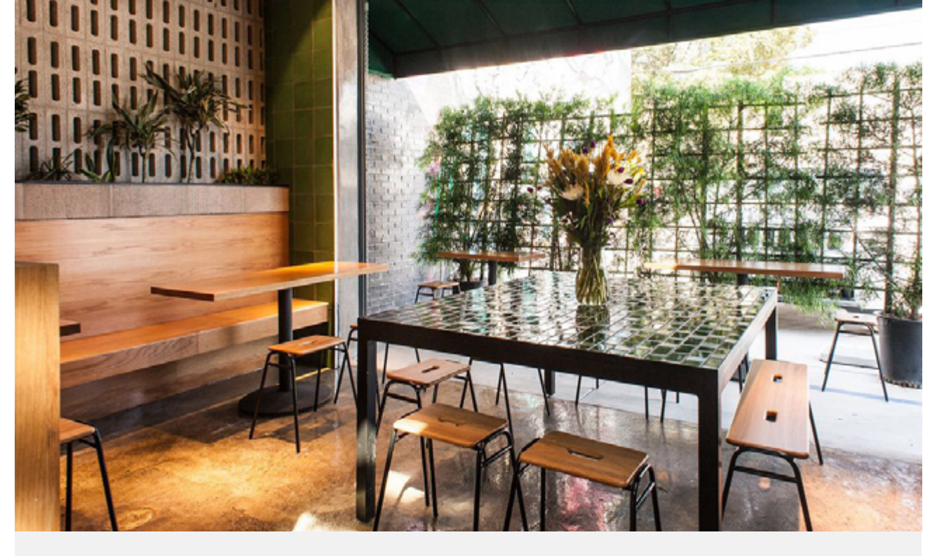
Working Girl Bench in RAL 9005 (Jet Black) with oak seat at Paramount Coffee, Los Angeles.