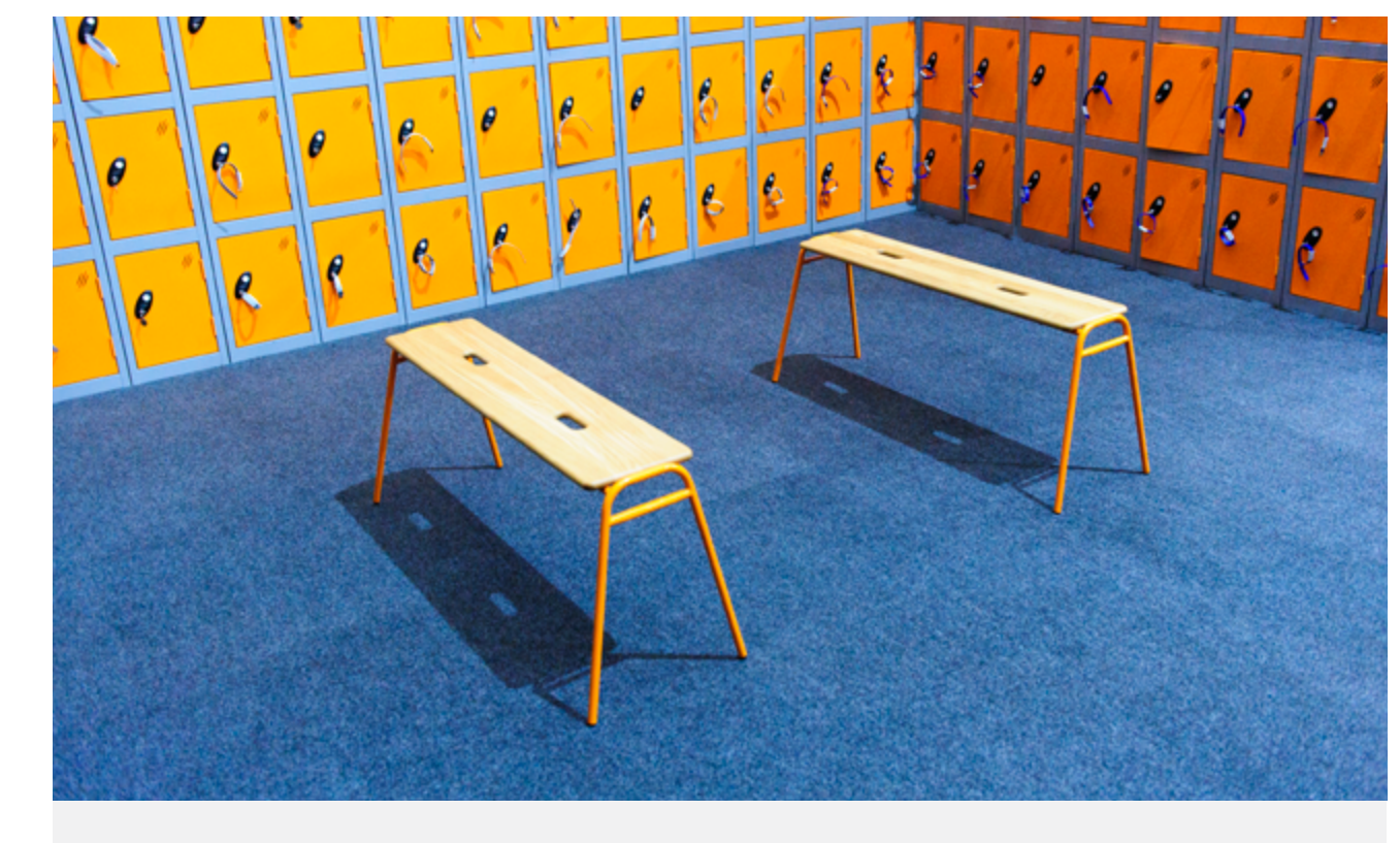
Working Girl Bench in RAL 2011 (Deep Orange) & oak seat at Better Extreme, Barking.