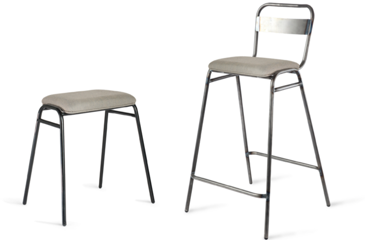
Above Working Girl Soft Stool in RAL 9005 (Jet Black) & Kvadrat Steelcut Trio 3 (246); Working Girl Soft Cross Stool in Raw & Kvadrat Steelcut Trio 3 (246). Right Working Girl Medium Soft Cross Stool in RAL 3022 (Dark Salmon Red) & Kvadrat Canvas 2 (984).

The Working Girl Soft features a powder coated or raw steel frame and a soft upholstered seat, available in a selection of fabrics.