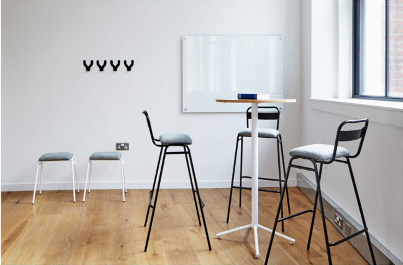
Working Girl Soft Stool in RAL 9003 (Signal White) & Bute Lewis (Munro) at Breather, Clerkenwell.