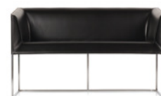
Gavi TS FG 343.01