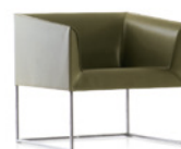
Gavi L FG 343.02