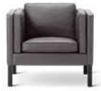
Mogensen 2334 Chair - 2334

W: 85 cm, D: 78 cm H: 78 cm, Sh: 43 cm Weight: 34 kg, Cbm: 0m 3