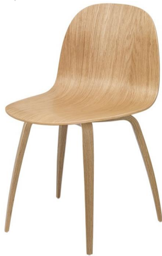
//Oak / Wood base