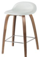
// White Cloud