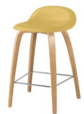
// Venetian Gold