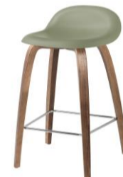
// Mistletoe Green