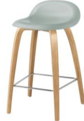
// Nightfall Blue