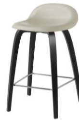
// Moon Gray