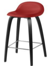
// Shy Cherry