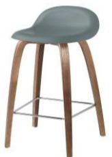
// Rainy Gray