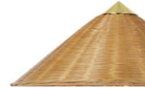
// Rattan Wicker shade