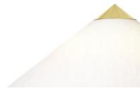
// Canvas shade