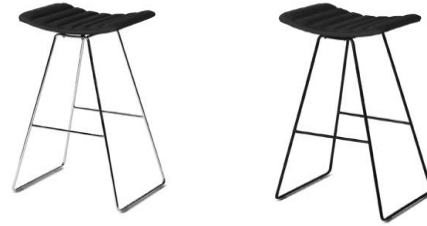
// Chrome frame // black leather // black frame // black leather