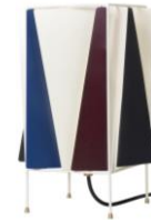
// French Blue