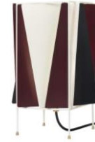
// Wine Red