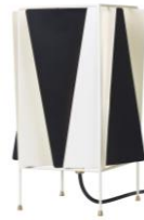
// Black & White