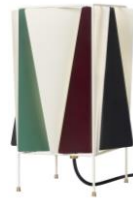
// Salvie Green