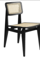
Black Stained Oak