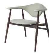
Smoked Oak finish