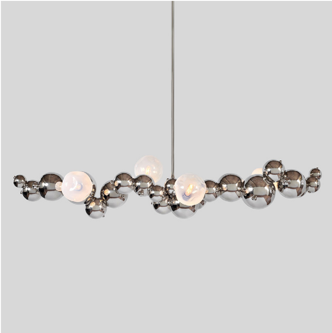
PICTURED IN POLISHED NICKEL WITH OPAL GLASS