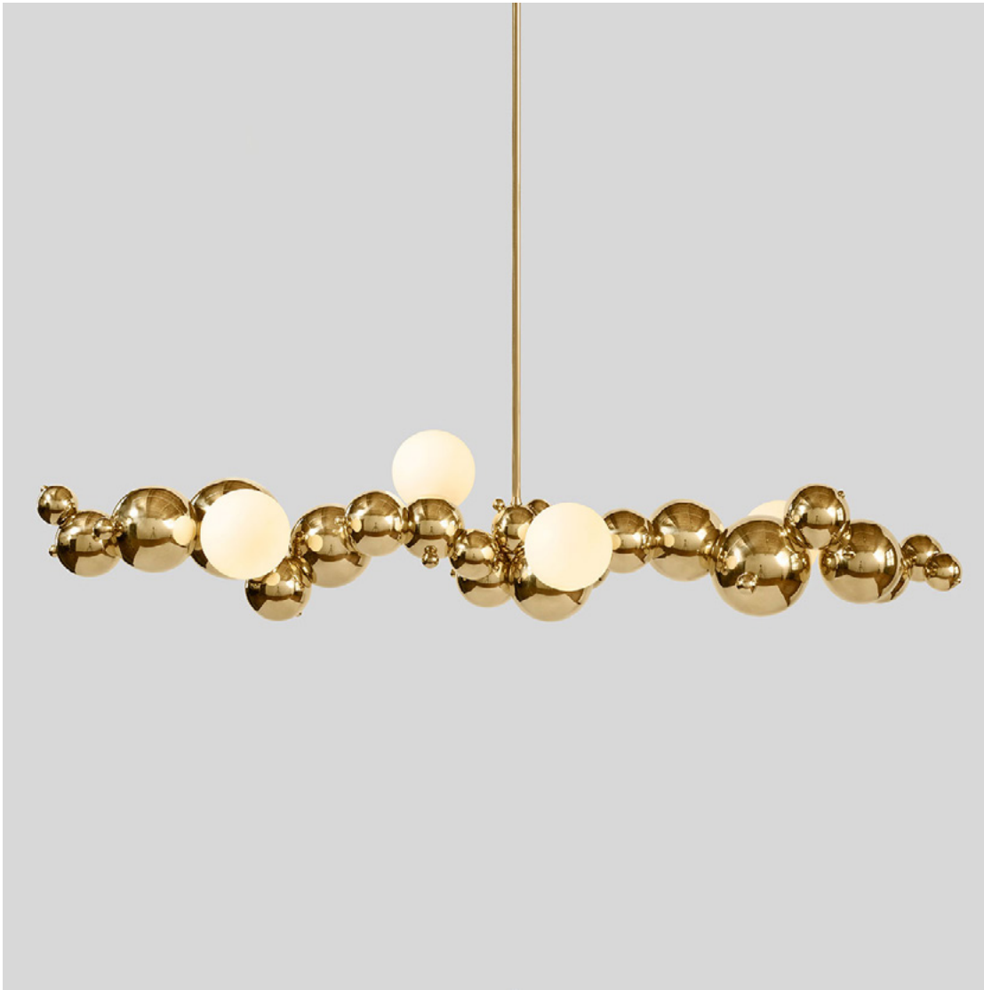
PICTURED IN POLISHED BRASS