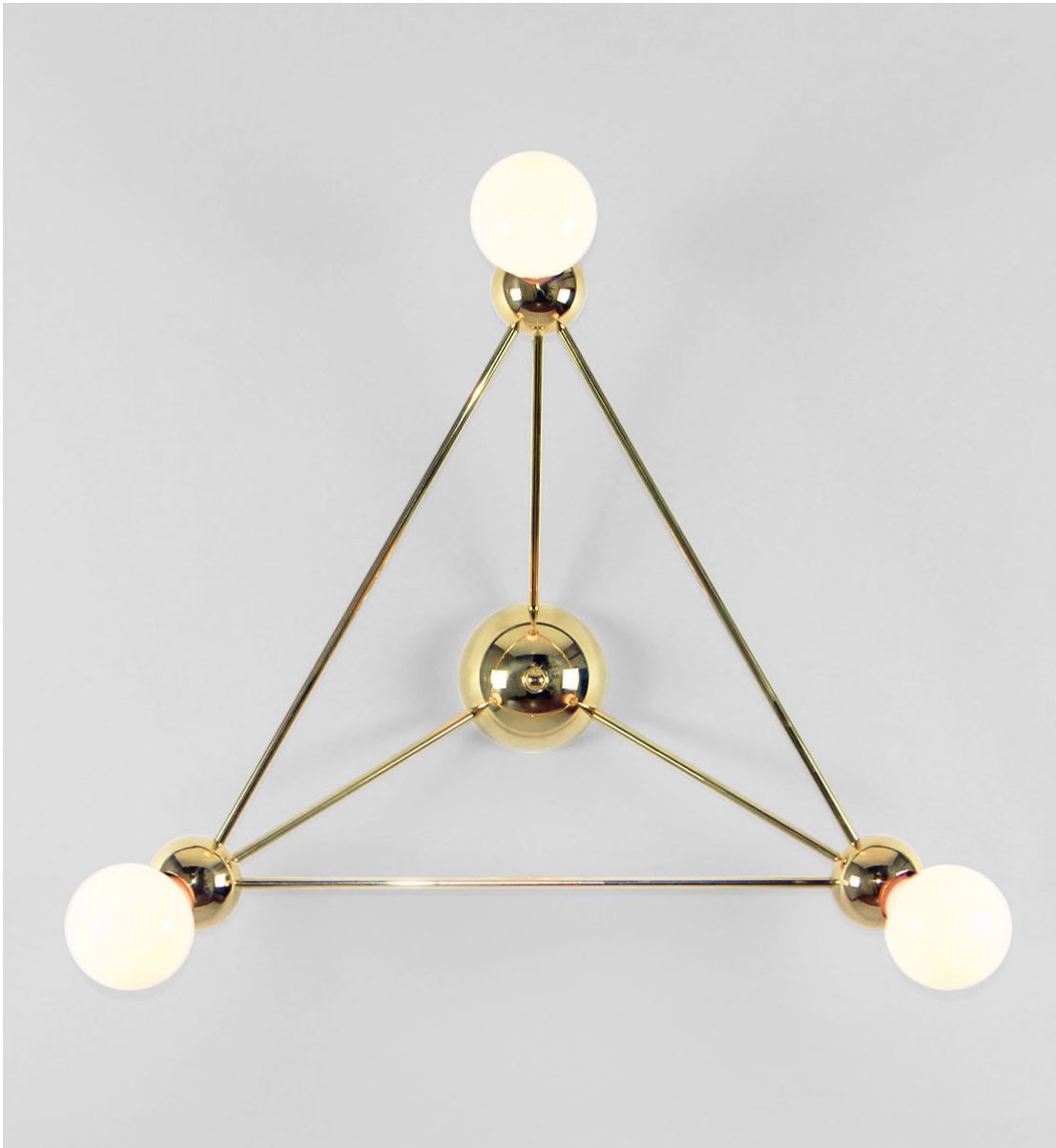
PICTURED IN POLISHED BRASS