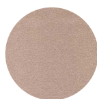
Ibiza light greige