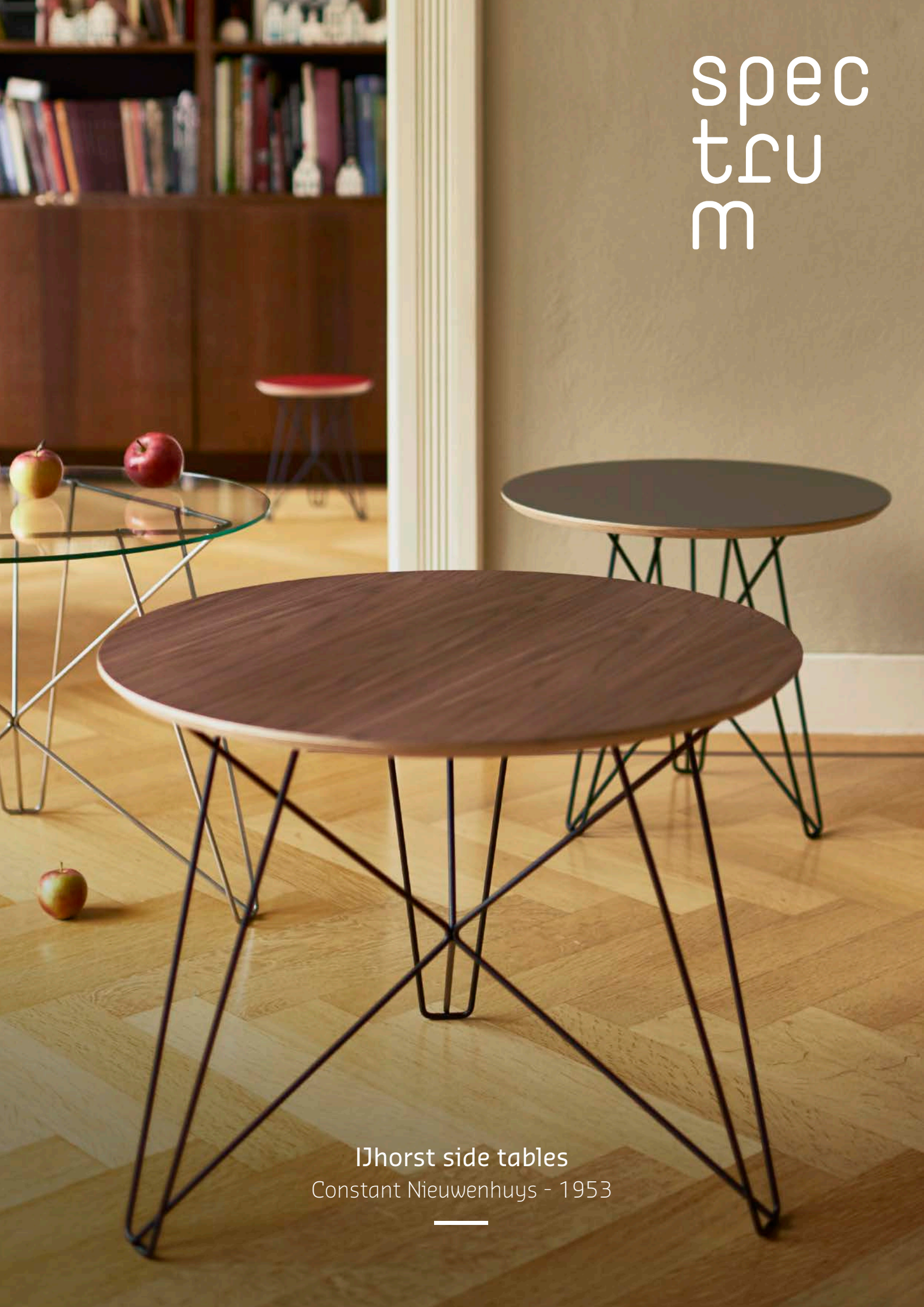
IJhorst side tables Constant Nieuwenhuys - 1953