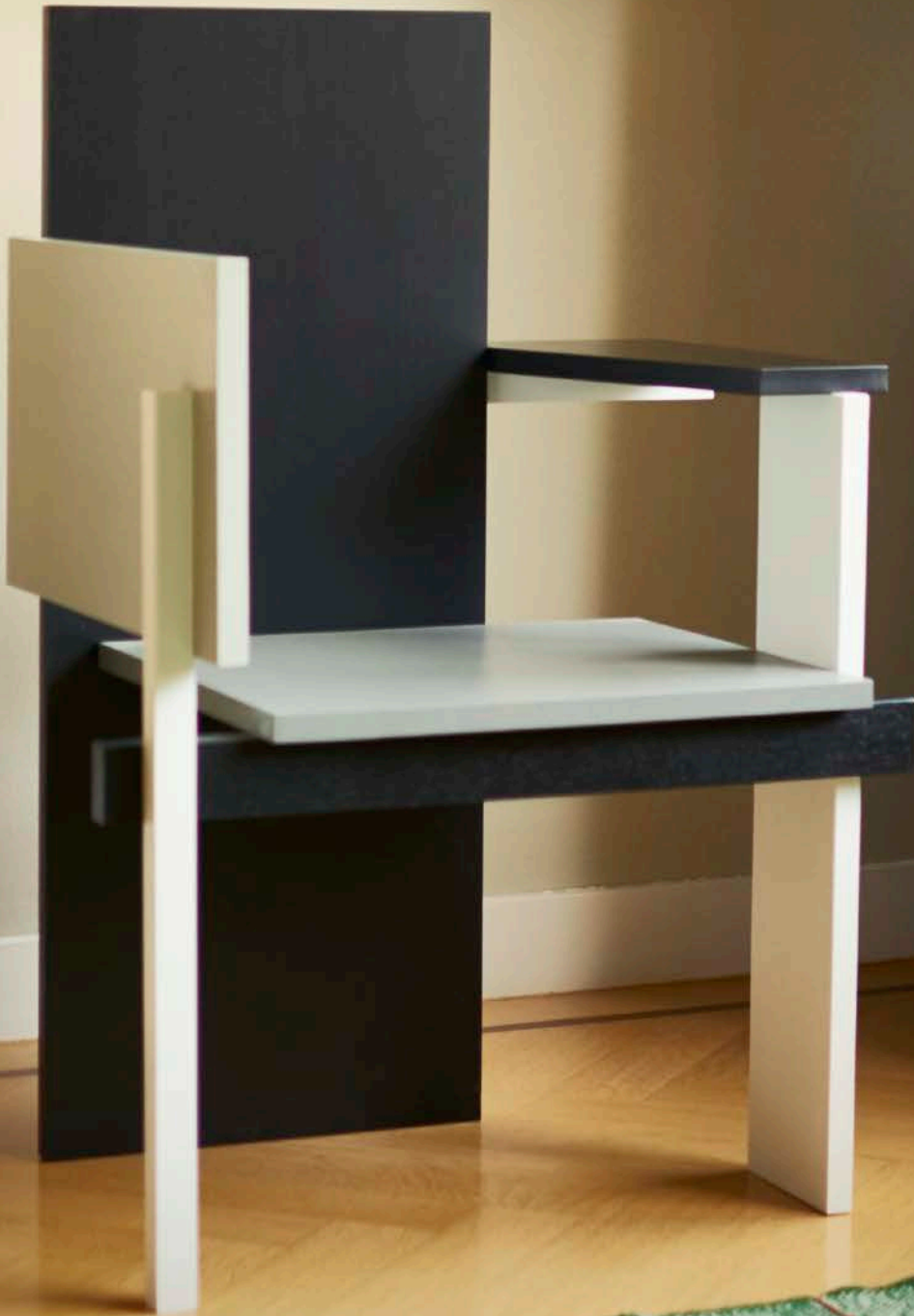
Berlin chair Gerrit Rietveld - 1923