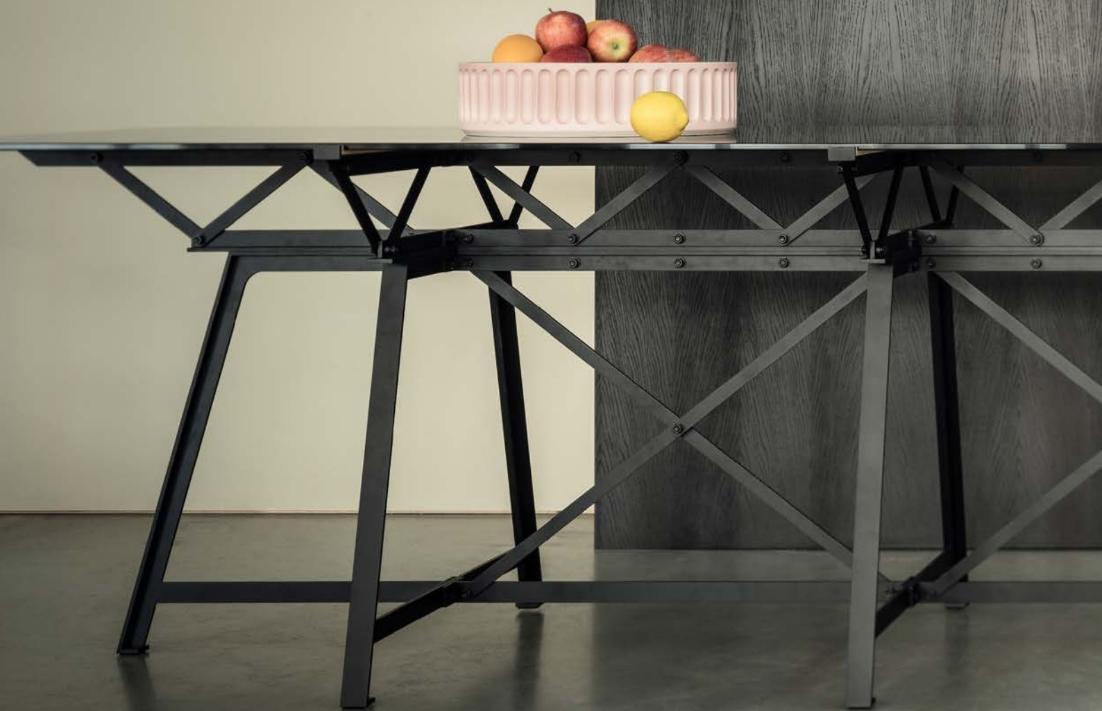
Endless table Aart van Asseldonk - 2018