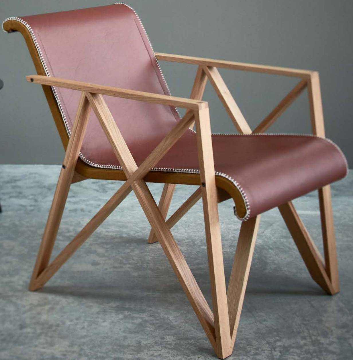
Armchair for Metz&Co Gerrit Rietveld - 1942