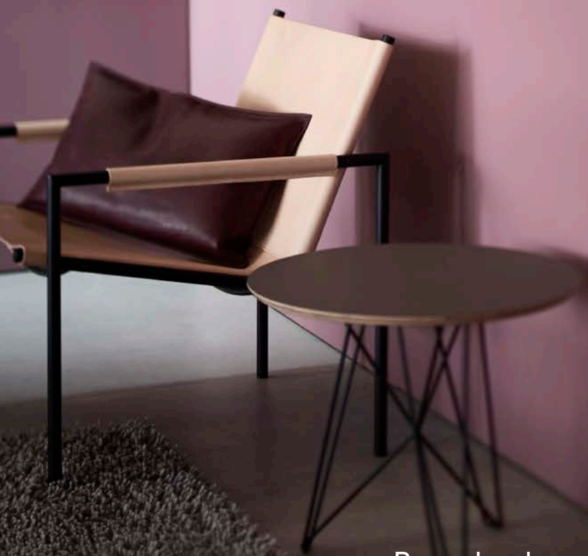
Paperback wall system Studio Parade - 2009