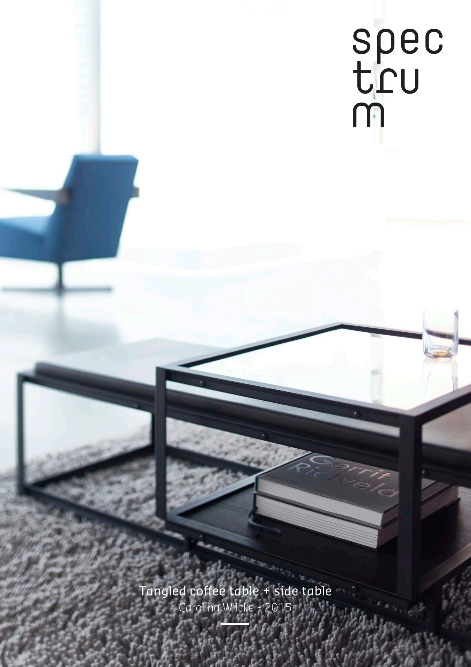
Tangled coffee table + side table Carolina Wilcke - 2015