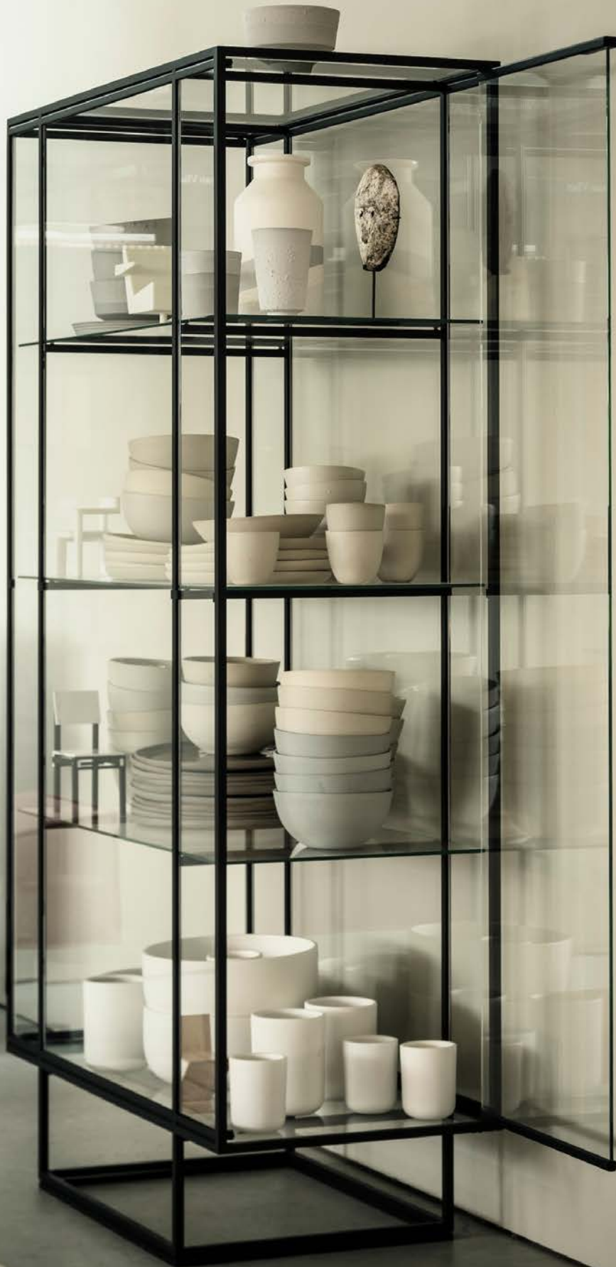
Tangled show case Carolina Wilcke - 2017