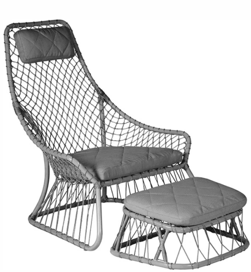
Ottoman sold separately.