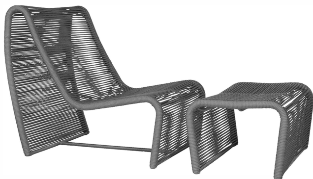
Armchair sold separately.