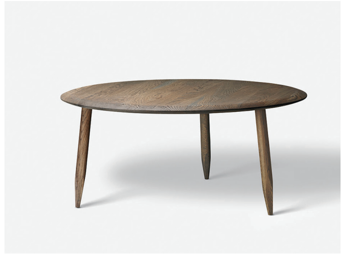
Smoked oiled oak