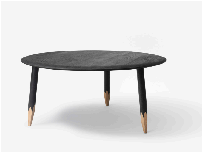
Black stained oak