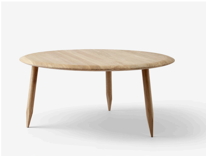
White oiled oak