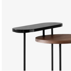
Nero Marquina & lacquered walnut