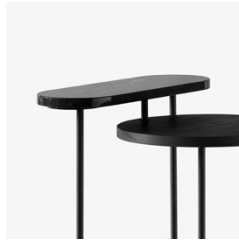
Nero Marquina & black lacquered ash