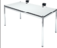
USM Haller Plus

Removable adaptation points for accessories