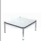
USM Haller occasional table, square

15"H 120"W/39"D 120"W/30"D 98"W/39"D 98"W/30"D 89"W/39"D 89"W/30"D 79"W/39"D 79"W/30"D 69"W/39"D 69"W/30"D 59"W/39"D 59"W/30"D 49"W/30"D 39"W/39"D 30"W/30"D