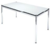
USM Haller Classic

Optional cable basket underneath the tabletop