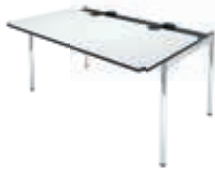
USM Haller Advanced

29"H or 27"-34"H* 79"W/39"D 79"W/30"D 69"W/39"D 69"W/30"D 59"W/39"D 59"W/30"D 49"W/30"D